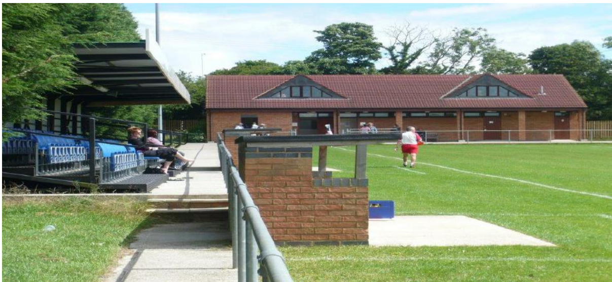
Stand & Pavilion